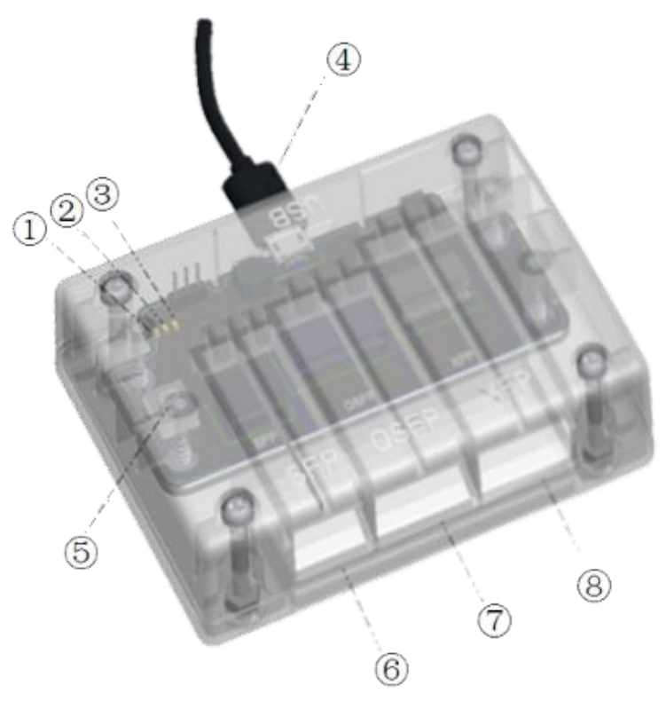
Figure 1: Device

①Green_LED: Normal Power Supply Indicator